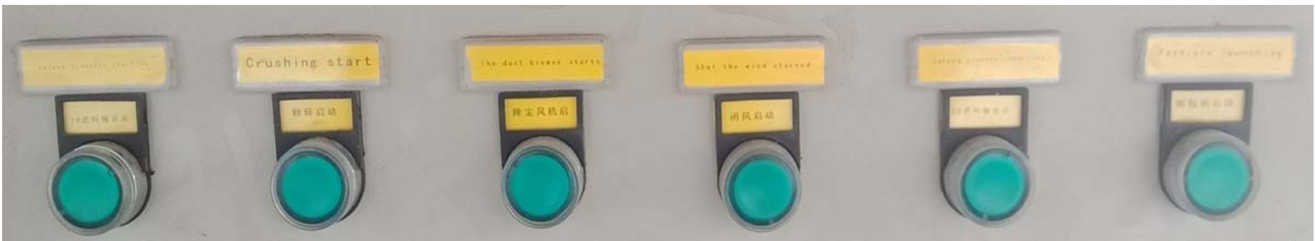
1#进料输送启动 粉碎启动 除尘风机启动 闭风启动 2#进料输送启动 制粒机启动 4 1 2 3 7 6