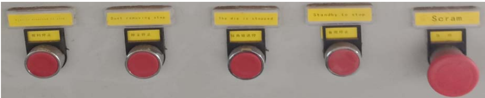
拨料停止 除尘停止 倾角输送停止 备用停止 急停