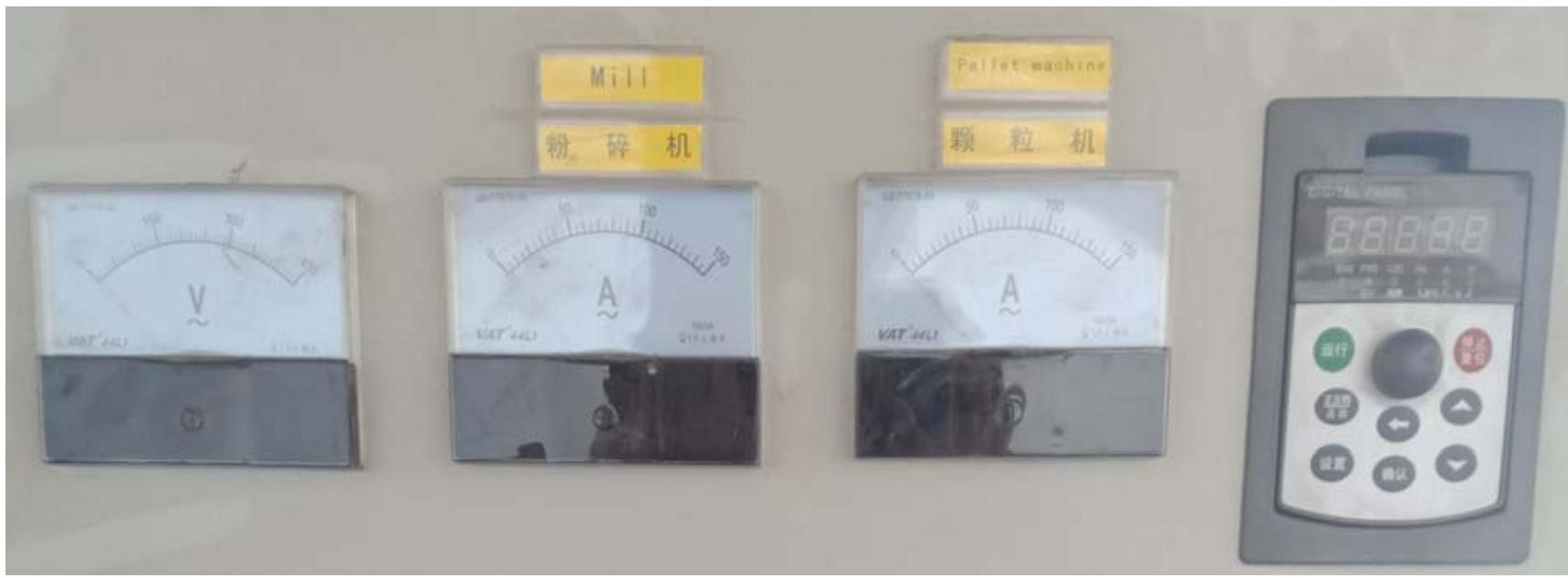
Conveyor to hammer mill Hammer mill Cyclon air fan cyclon air-lock screw conveyor pellet machine start 1# feed transfer starting Crushing start The Dust blower start shut the wind start 2# feed transfer starting pellet machine start