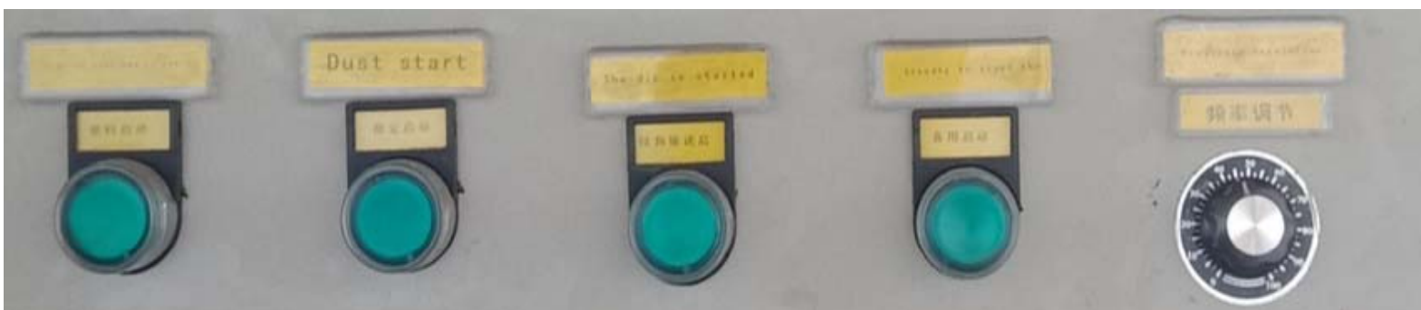
拨料启动 除尘启动 倾角输送启动 备用启动 频率调节（上料绞龙） 5 8